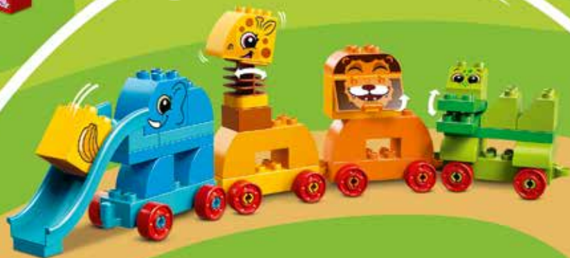
10863 Ages 1½-3