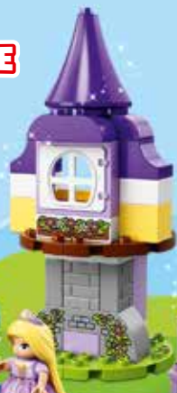
10878 Ages 2-5