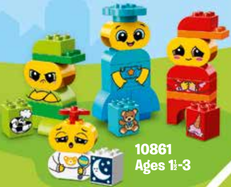
10861 Ages 1½-3